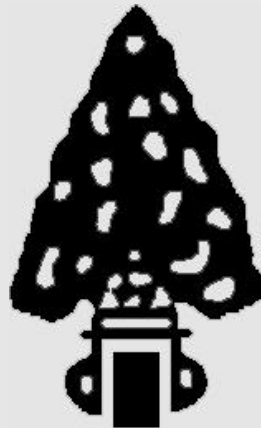
Section Officers 1999-2000