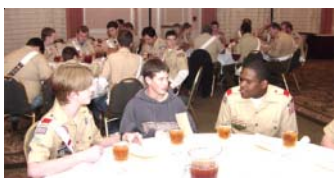
Interlodge fellowship at the Banquet

Saturday night everyone assembled for the closing banquet. During the feast,