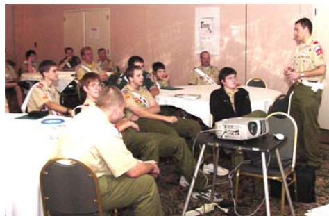
One of the many training sessions

“Catch the Higher Vision,” the theme for this year’s ArrowTech challenged every participant to consider how he or she could better serve the Order. As over 125 brothers from across SR-5 gathered to train and share fellowship the door was opened for more open communication of