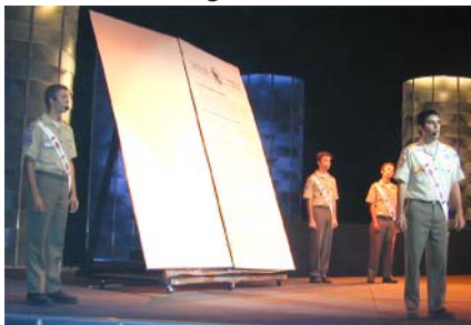
Region Chiefs unveil '03-'07 Strategic Plan at NOAC

Dear Brothers of SR-5 I hope the holidays are approaching you with feelings of joy and happiness. As for us in Itibap we are in the continuing stage of transition and growth for our lodge. At our recent lodge gathering, the Fall Fellowship, we held our lodge elections for the 2003 lodge