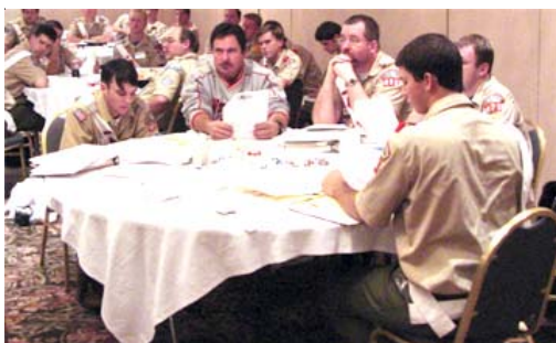
Host Lodge Dixie committee

By the time you read this article, we will have already received your lodge's Dixie Registration and Pre-