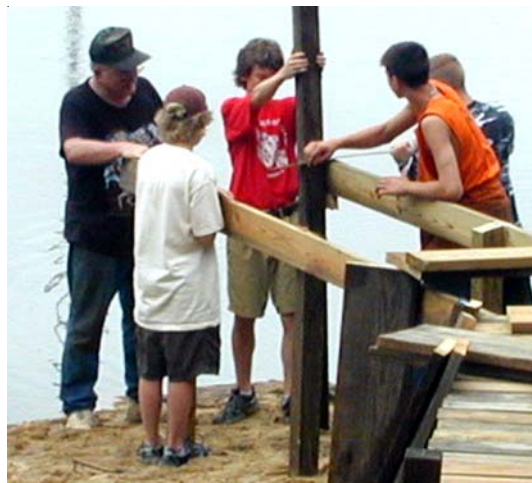
Bob White members build new boating dock at Camp Linwood Hayne

For more information, visit the national OA Web page from the