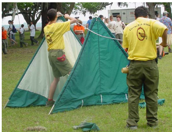
Bob White Lodge in the tent pitching competition

Be sure to check your Guidelines for details on each of the events. If you have any questions, please don't hesitate to contact me by phone at (843) 953-1346 or e-mail at SmithG@Citadel.edu . I do ask that you remind the judges from your lodge about the meeting that will be held