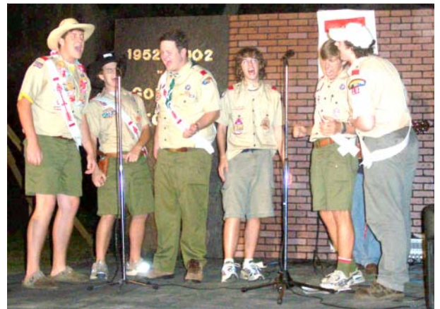
Brothers singing during the Saturday Night Show