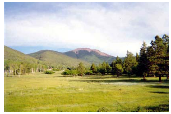
The Meadow with Miranda and Baldy in the background

After a quick stop in base camp, where we got a much needed shower and laundry run, we headed back out, but this time for our self-planned trek. Those days were memorable, as we traded off the jobs of navigator and Crew Leader daily. We covered most of Philmont's Central Country, seeing natural sights such as Cathedral Rock and Lover's Leap, and getting a taste of Philmont's backcountry programs, such as sparclimbing, black-powder rifle shooting, and metal forgery. The staff at Crater Lake really appreciated having a Trail Crew in camp, and we even got a fresh bag of cherries for helping them chop some wood. But nothing compared to the Stomp at Cypher's Mine, where we rocked the cabin until the late hours of the night. The sights on our trek