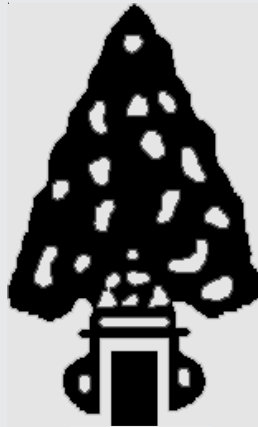
Section Officers 2004-2005