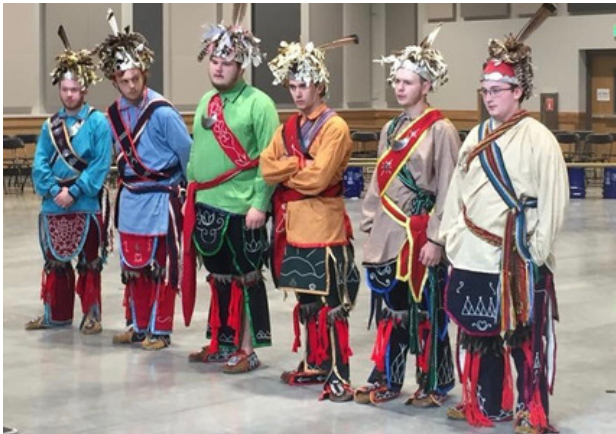
Eswau Huppeday Lodge National Champion Historical Group Dance