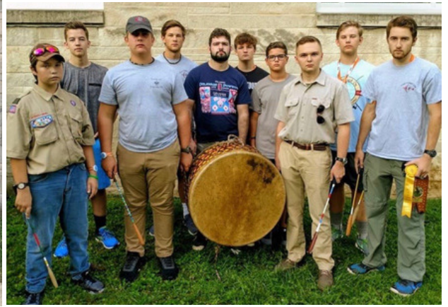
Tsali Lodge National Champion Sing Team