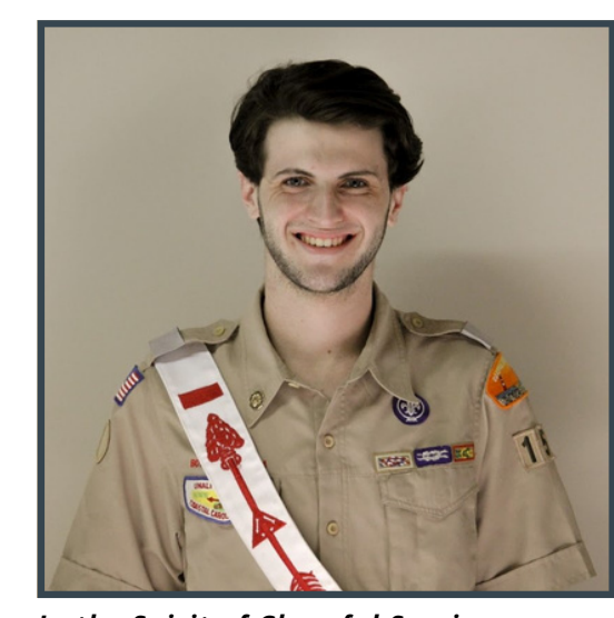
In the Spirit of Cheerful Service,

With that, I thank you for your continued leadership as you've continued to carry out our mission as a brotherhood built on the ideals of cheerfulness in the service of others.